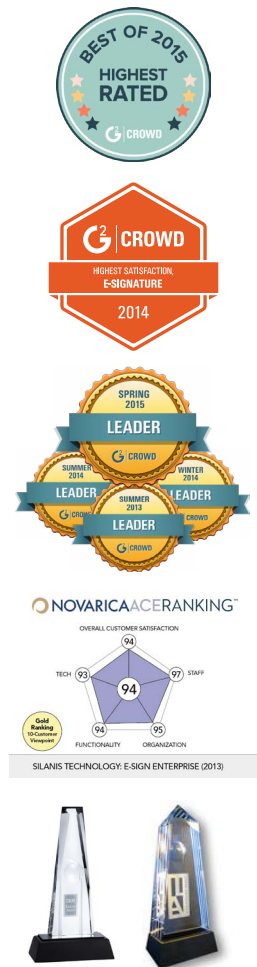
Winner of IBM's Best Cloud Computing Award and Best Industry Solution for Banking and Insurance